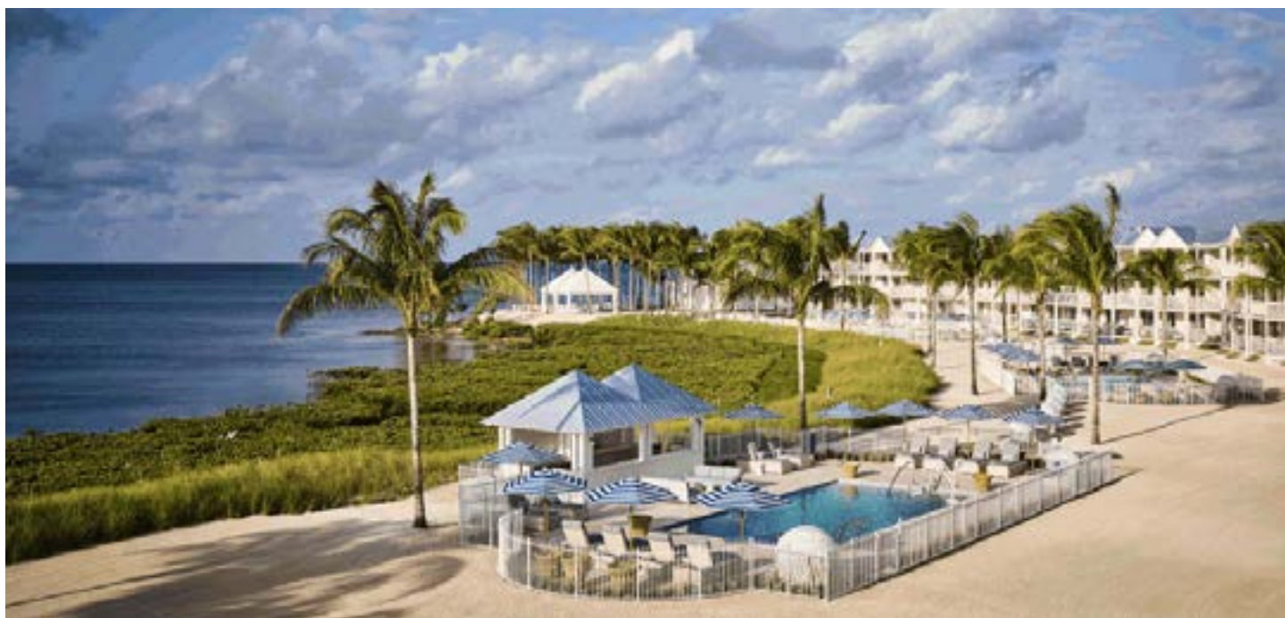
Isla Bella Beach Resort

245 Front Street Key West, FL 33040 https://www.opalcollection.com/capitana/ | 305.296.6925